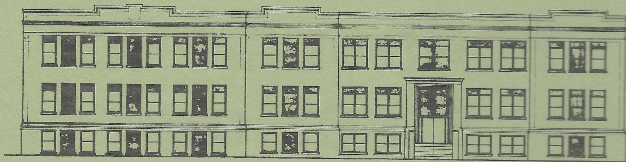
WEST ELEVATION N. 112

Proposal: Remove the present floor, install an adequate moisture barrier and a "free floating" type of gym floor which allows for expansion and contraction of the wood surface.